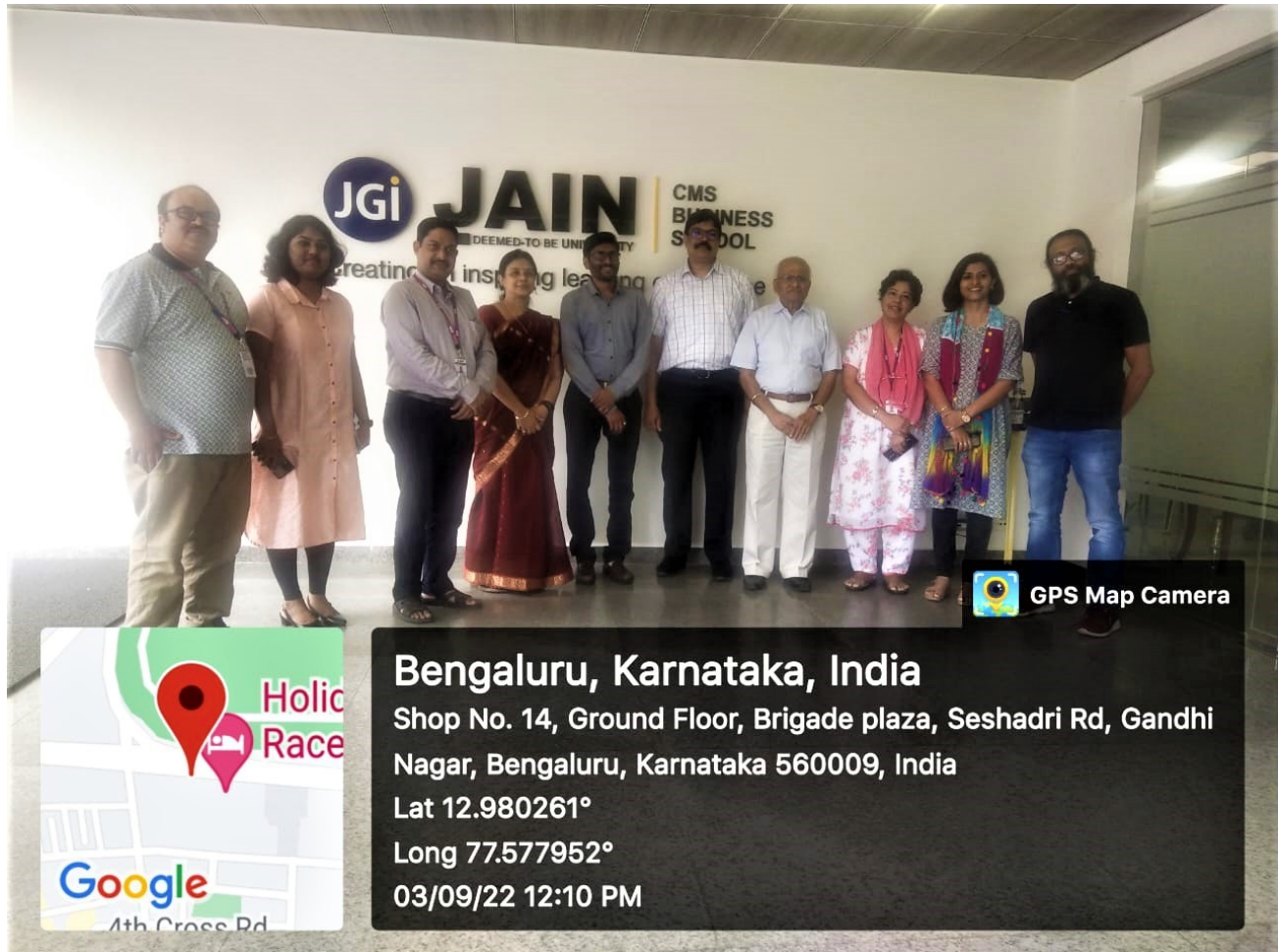
Fig : 1.5 Group photo of the participants along with resource person