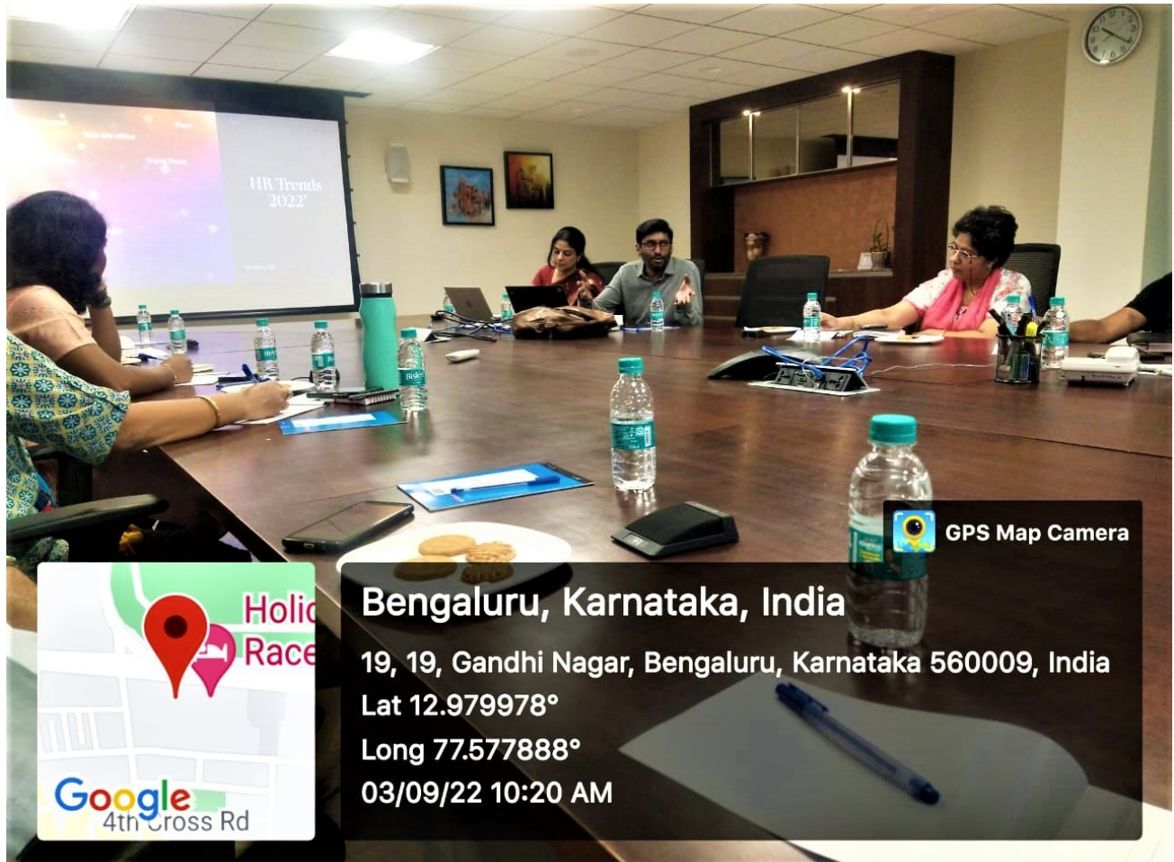
Fig : 1.3 Resource person of FCM , Vardaraj AV answering queries of the participant faculty members