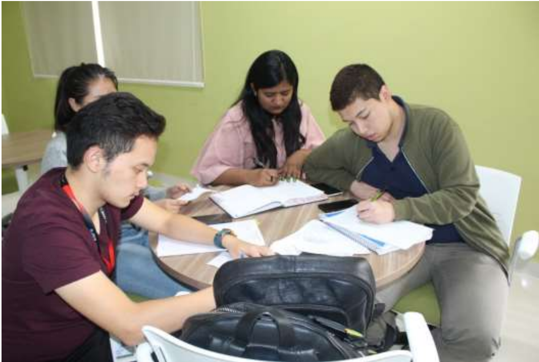
Students at the workshop

A video was played which answered some important questions like: