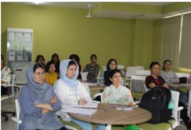
Students at the workshop