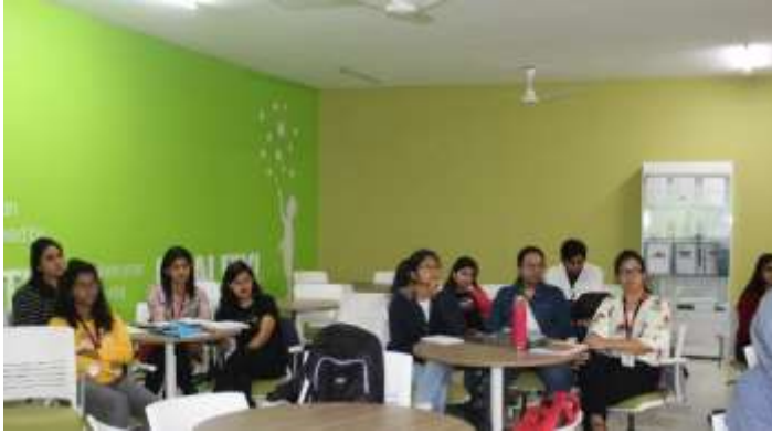
Students at the workshop

HR analytics understands the importance of certain top performing employees and helps the employers retain them by investing in them through performance appraisal and conducting training programs.