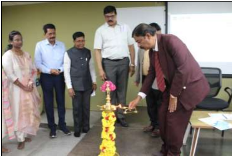
Image 5: Participants