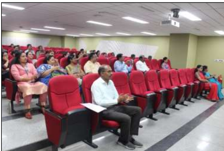
Image 6: Participants