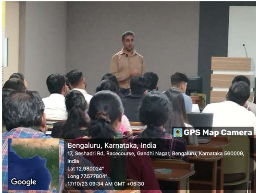
Fig : 1.1 Hands on training, workshop on Data Analytics and SPSS, held on October 17 th (Batch and Event: 2023-25; Programme: MBA, Semester I)