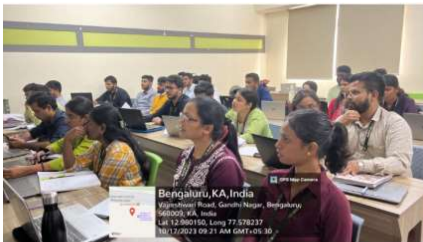
Fig : 1.6 Hands on training, workshop on Data Analytics and SPSS, held on October 17 th (Batch and Event: 2023-25; Programme: MBA, Semester I)