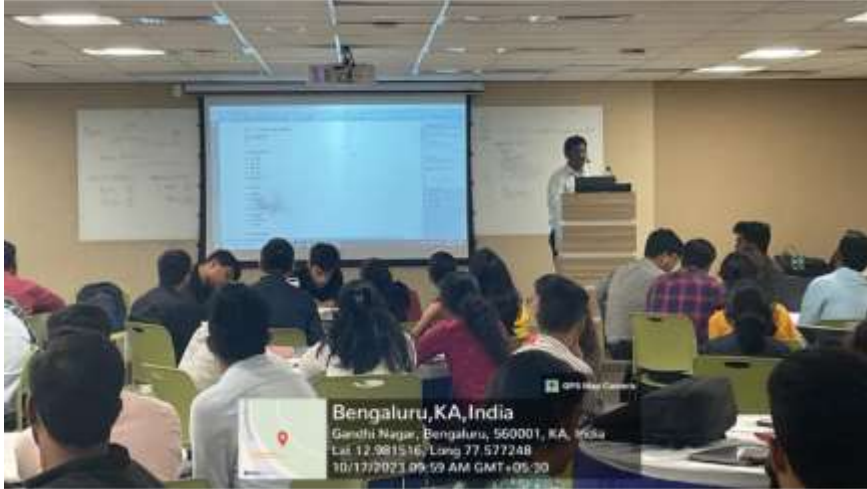
Fig : 1.3 Hands on training, workshop on Data Analytics and SPSS, held on October 17 th (Batch and Event: 2023-25; Programme: MBA, Semester I)