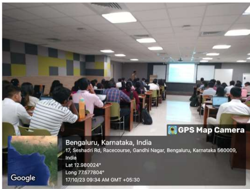
Fig : 1.2 Hands on training, workshop on Data Analytics and SPSS, held on October 17 th (Batch and Event: 2023-25; Programme: MBA, Semester I)