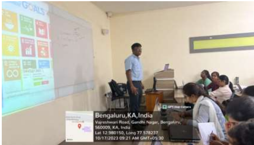
Fig : 1.5 Hands on training, workshop on Data Analytics and SPSS, held on October 17 th (Batch and Event: 2023-25; Programme: MBA, Semester I)