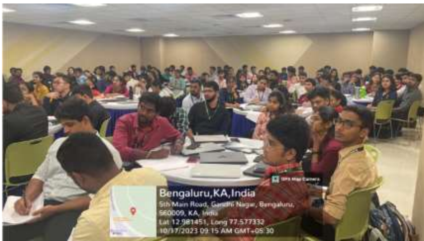
Fig : 1.4 Hands on training, workshop on Data Analytics and SPSS, held on October 17 th (Batch and Event: 2023-25; Programme: MBA, Semester I)