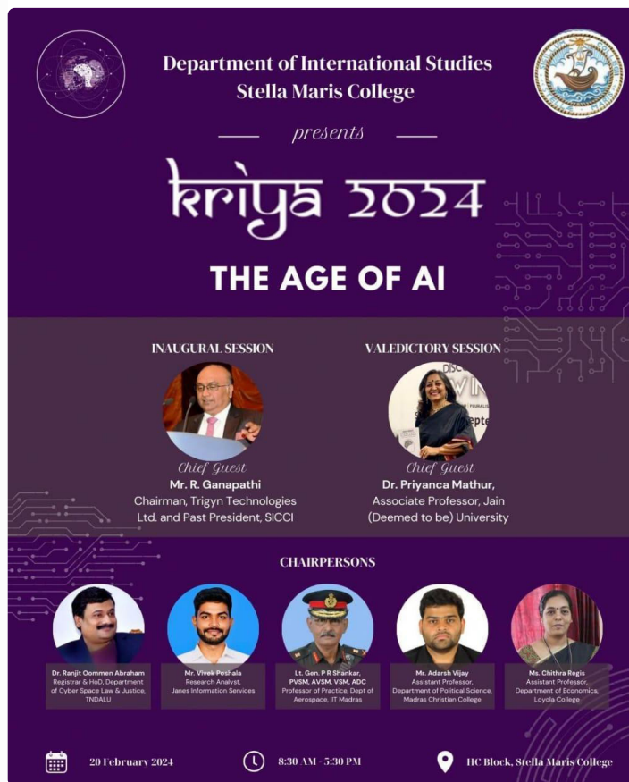
Poster of the Seminar

A group of 18 students accompanied by 4 faculties from the Centre for Research in Social Sciences and Education, JAIN (Deemed-to-be University) on 19th to 21st February, completed an enriching educational trip to Chennai and Pondicherry. The primary focus of the trip was a Seminar organized by the Department of International Studies, Stella Maris College, Chennai on 'The Age of Artificial Intelligence', held on 20th of February, 2024.