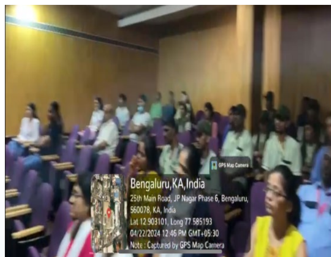
Faculties, students, teaching and Non-teaching staff taking voters pledge