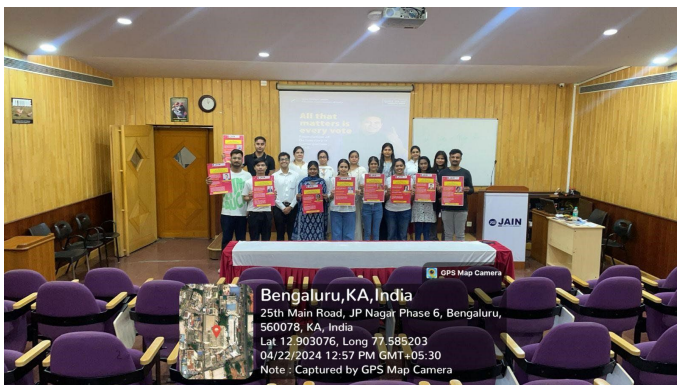
Group Photo: M.A Political Science and IR Students and Faculties of Centre for Research in Social Sciences and Education (CeRSSE), JAIN (Deemed-to-be) University, Bengaluru.

The event lastly concluded with everyone singing the National Anthem together that instilled a sense of proud citizenship amongst all. Overall, the Voter Awareness Campaign, "Empowering Every Vote" successfully engaged participants through informative presentations, multimedia content, interactive discussions, and a symbolic pledge ceremony. The event effectively conveyed the importance of democratic participation and encouraged citizens to exercise their voting rights responsibly. It served as a platform for fostering civic responsibility and strengthening democratic values among the community.