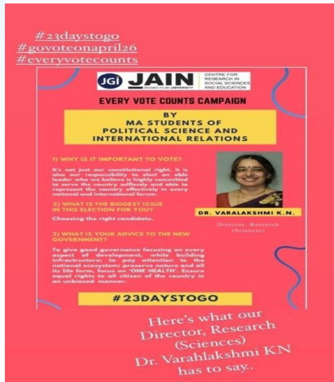
Poster: Posters from Every Vote Counts Campaign