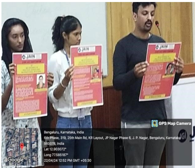
Students highlighting comments from various opinions on why it is important to vote