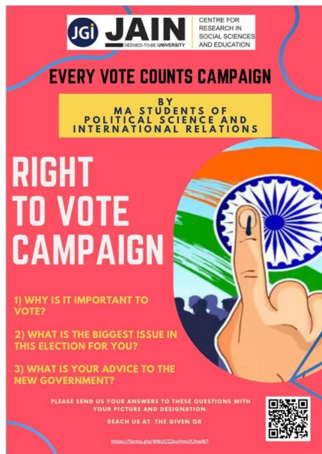
Poster: Every Vote Count Campaign

The MA students shared insights into their on-going "Every Vote Counts" campaign. The campaign has been extensively taken out through social media everyday using hashtags such as #everyvotecounts, #govoteon26april, #ECISVEEP, #UGC_India to spread awareness as much possible. They discussed the campaign's objectives, which included gathering opinions from faculties and administrators of various centres across JAIN (Deemed-To-Be University) gathered in a span of 20 days campaign. Students queued up with posters highlighting questions why is it important to vote? What is the biggest challenge this election? And what will you advice the future government? Students read out views of different Professors, Academicians from various centres on the above questions. Every student highlighted comments given by various professors, heads and directors of the institution gathered during the 24 days every vote counts campaign in points thus educating on the importance of voting.