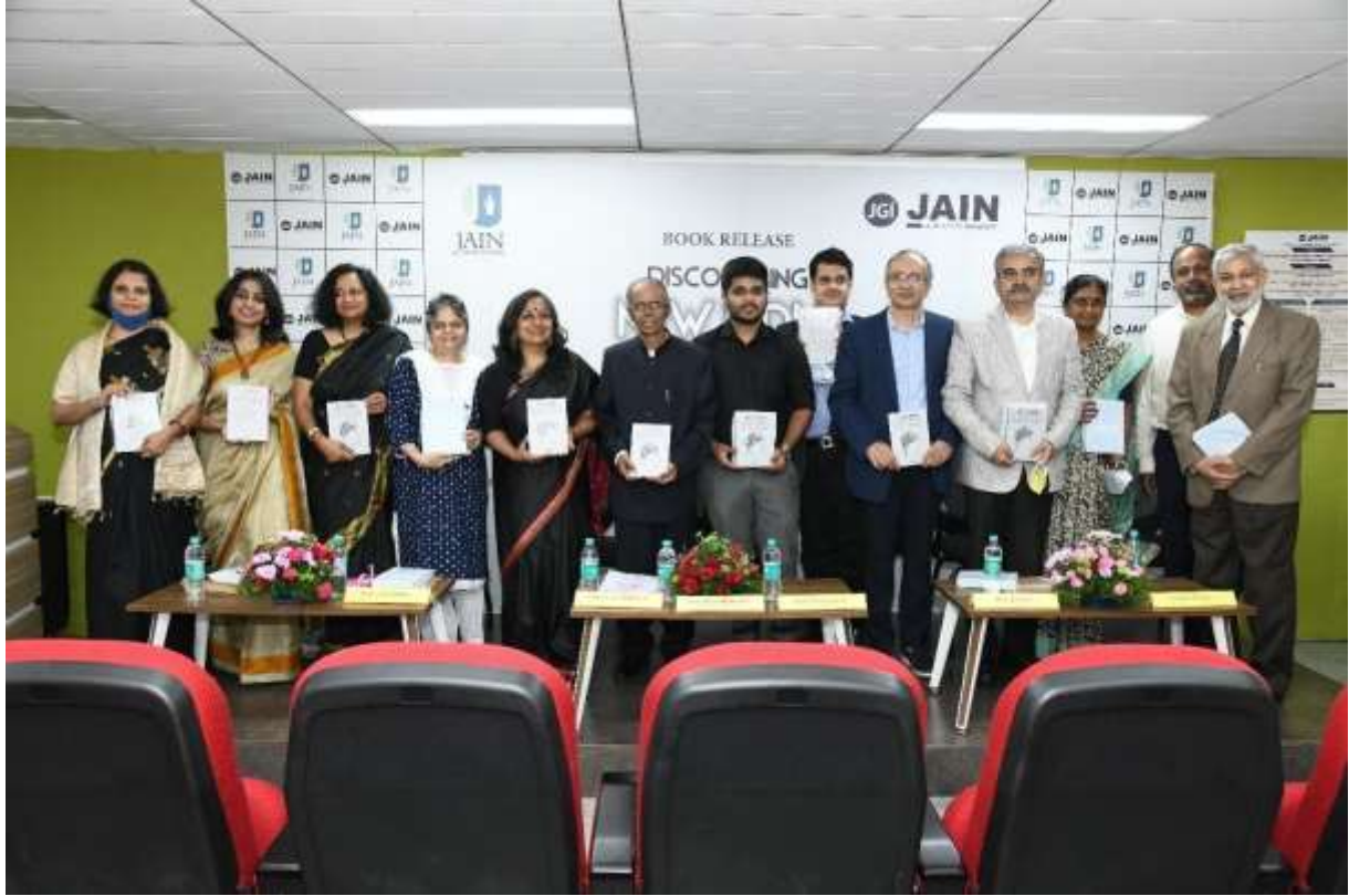
Authors holding the book after the release