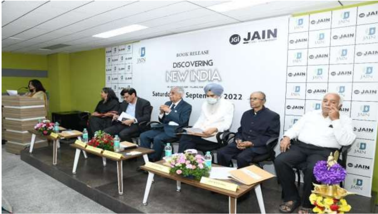
Dignitaries seated during the book release event