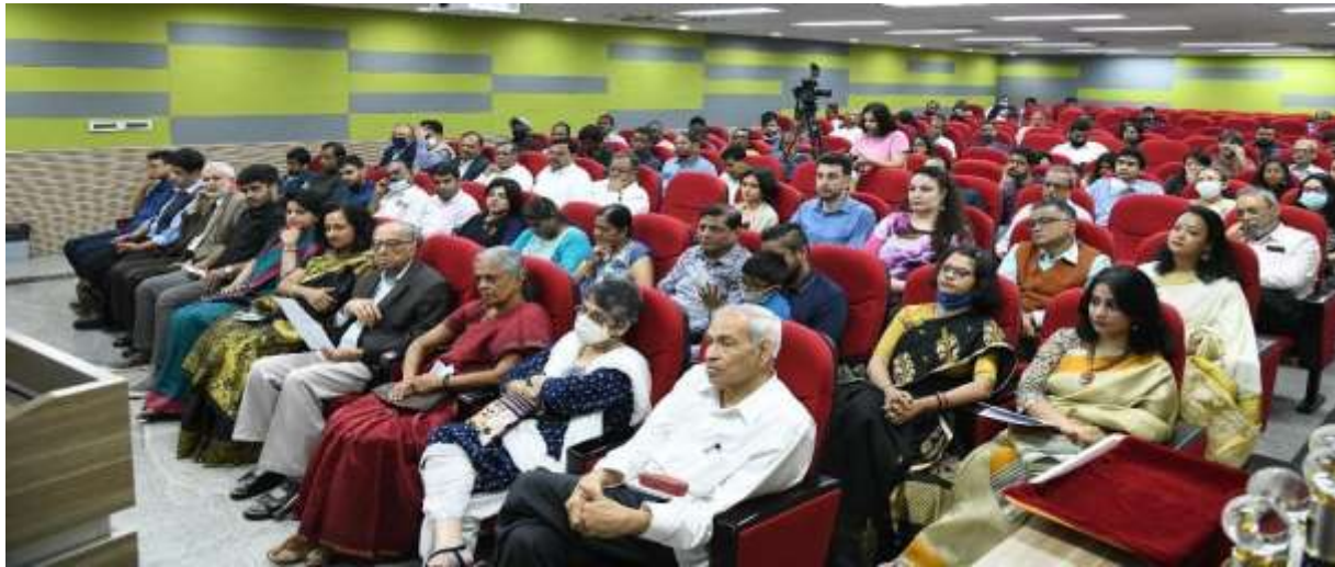
Audience during the book release