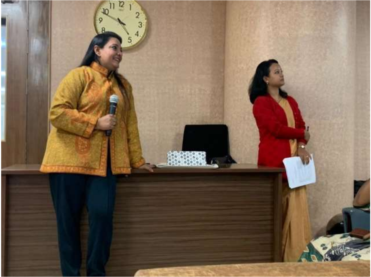
During the interactive sessions with the students