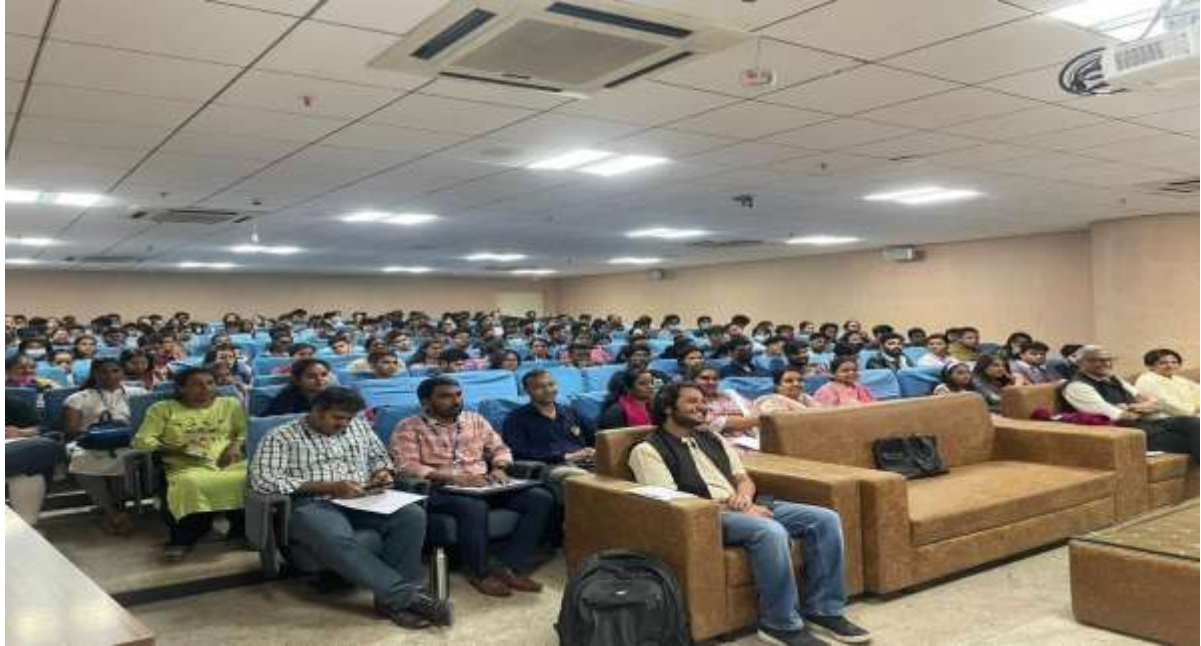
Audience during the panel discussion