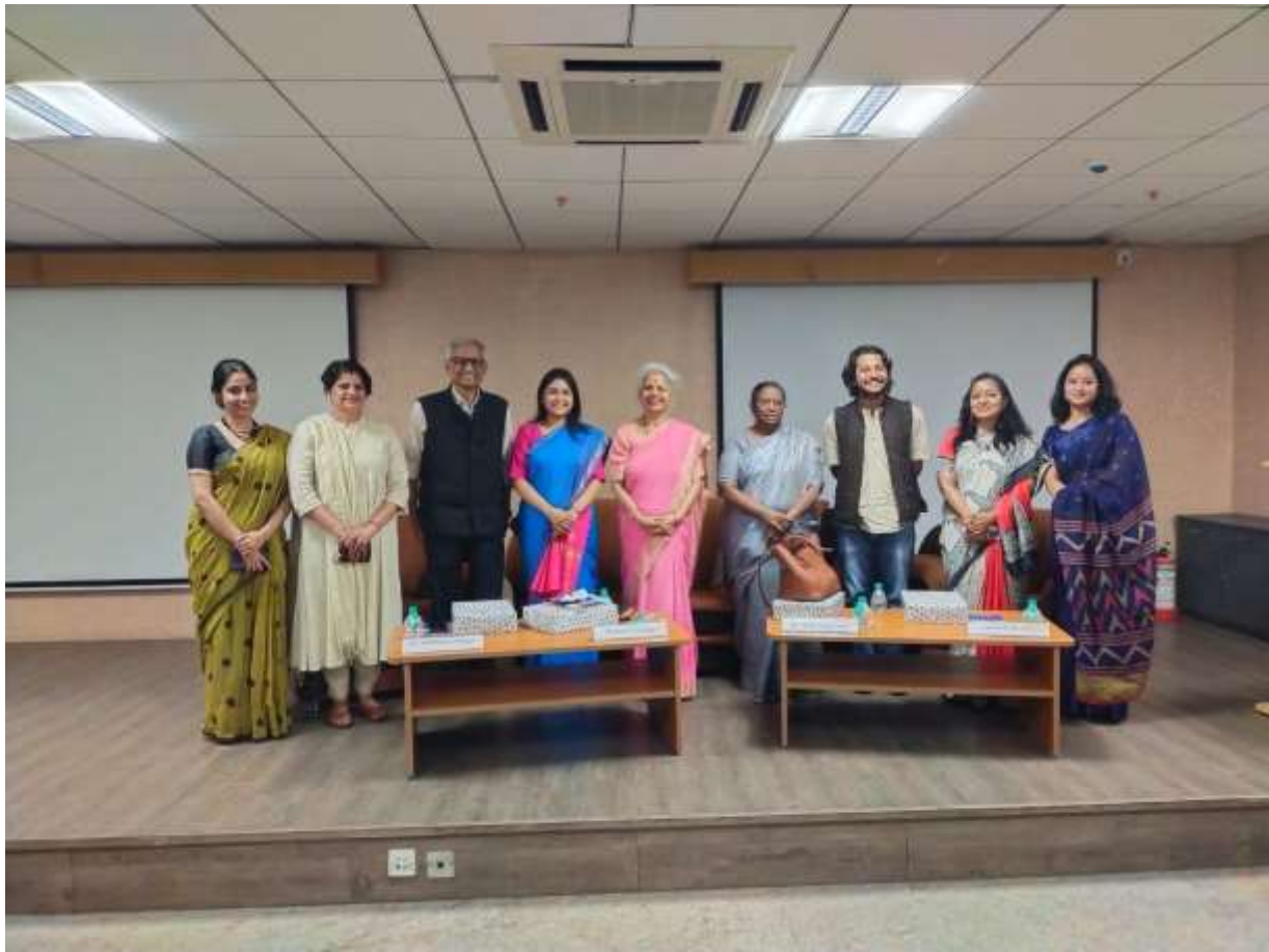
Resource Persons with the Organising Team