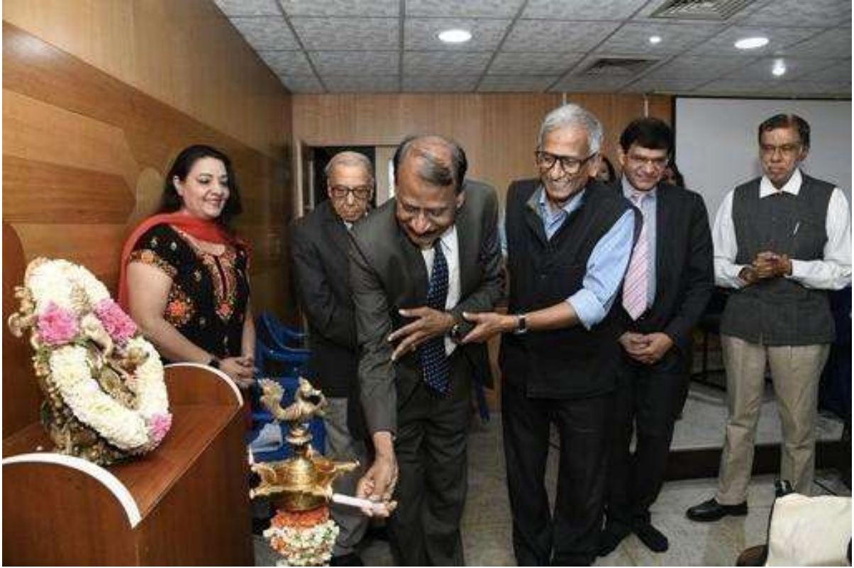
The lighting of the lamp by the Dignitaries