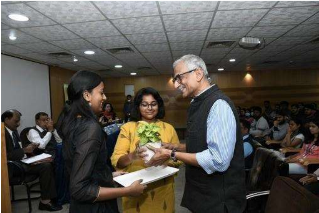
MAPPA Students welcoming dignitaries with a plant