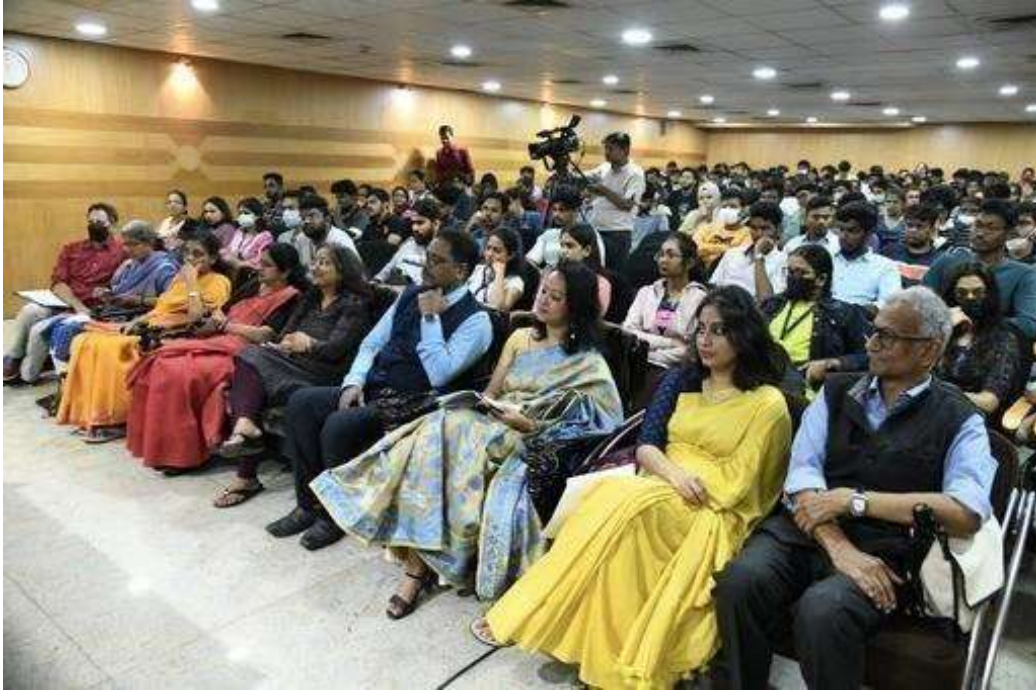
Audience during the event