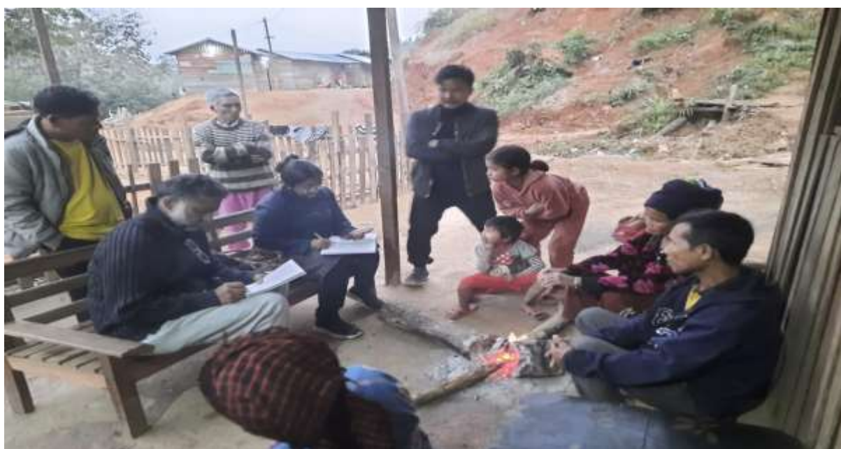
Conducting fieldwork on the Indo-Myanmar border

3. Engaged in Primary Data Collection in Manipur, Mizoram and New Delhi for Field Work of an International Research Project on the Protection Needs of Myanmarese Refugees in India, awarded by the Foundation for the Study of Displaced Populations (FSDP), Thailand.