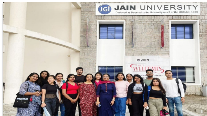
Visit to JAIN Global Campus